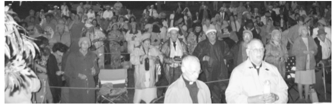
June 11: Our Lady's 35th Anniv. Vigil