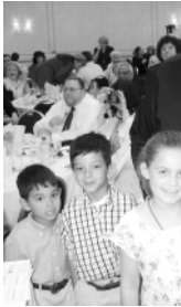
June 12: Our Lady's 35th Anniv. Vigil the Marriott and...