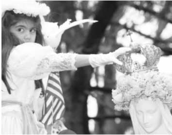
Annual May Crowning