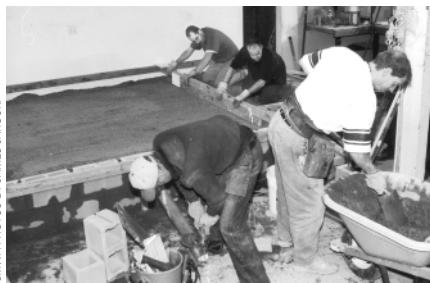
THE LAY ORDER OF ST. MICHAEL building a platform for our 22-foot web press.