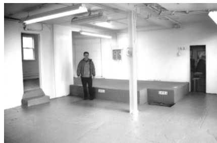
READY FOR THE MOVE