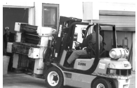
MOVING DAY one of our presses; steel roll-up door on right.