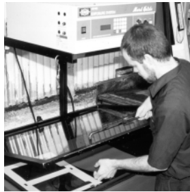
Exposing the press plates