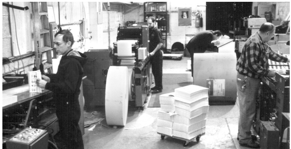
The lay order of St. Michael preparing this mailing: printing, folding and quality control. (circled photos) December 5 Sunday Holy Hour. (pg 3) The Rosary that is regularly venerated by the pilgrims was kissed by the Blessed Mother at the October 29, 1994 vigil.