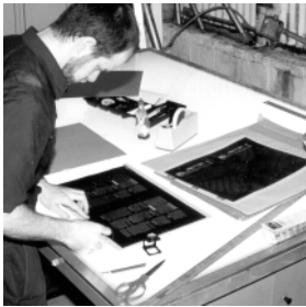
Composing the negatives