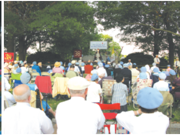
550 pilgrims from across the globe